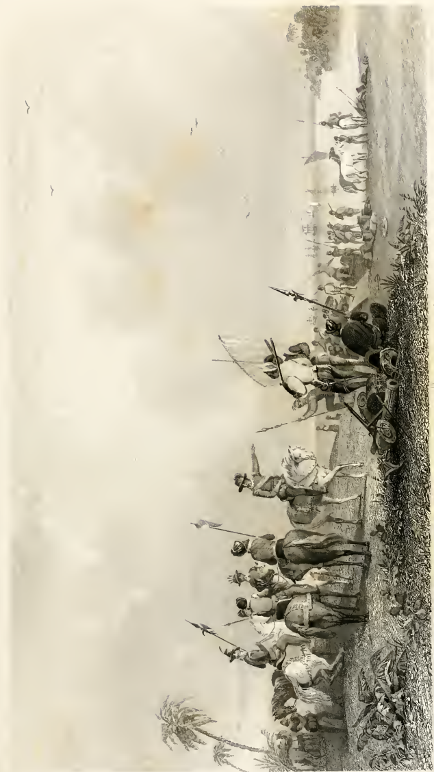
THE CAMP OF THE ARMY AT THE MOUTH OF THE RIVER